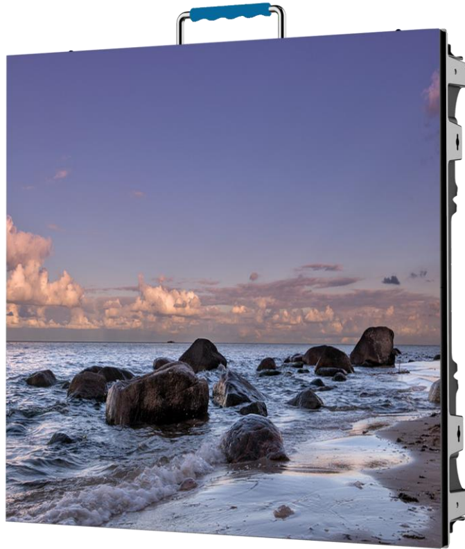
MW77XX-FI Indoor Fixed LED Display Screen